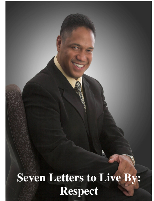
3rd Book– Just Released!